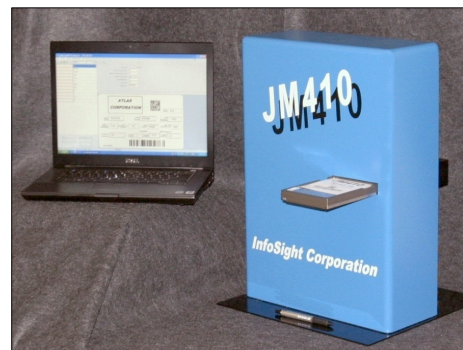
JM410 ID Tag Printer shown with a laptop computer running LabeLase® Producer™

After two years of thorough product design, InfoSight has come to the Asset ID market place with the JM410. This is targeted for manufacturers who require a high performance tag from a low price printer. The JM410 reduces the initial cost of a genuine CO 2 laser printer to a bare minimum. This allows small quantity users of high durability metal tags the ability to afford a cost effective solution. The JM410 features a wide marking area of 4" x 4" and a 10-watt high quality laser. The unit is priced at almost half the cost of a competing printer.